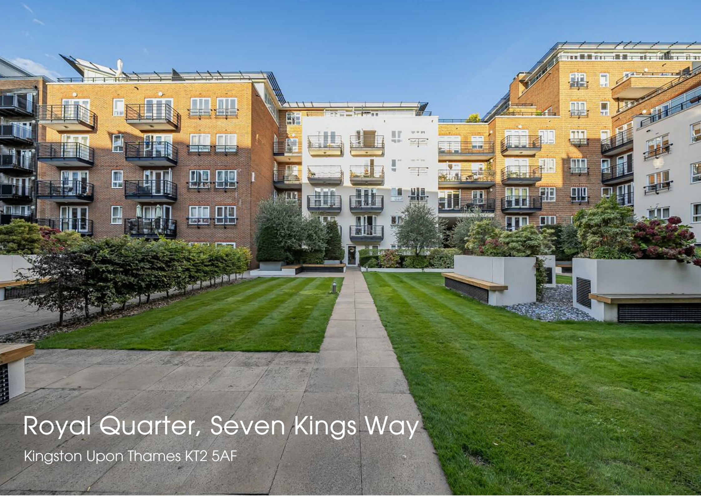
Royal Quarter, Seven Kings Way Kingston Upon Thames KT2 5AF